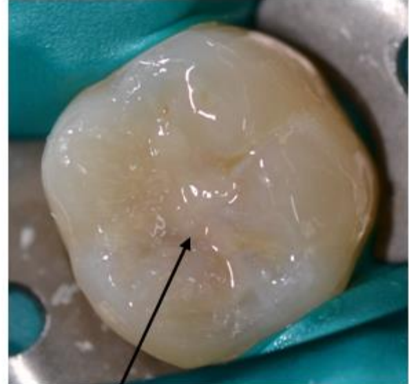
A sealant is applied to chewing surface of molars